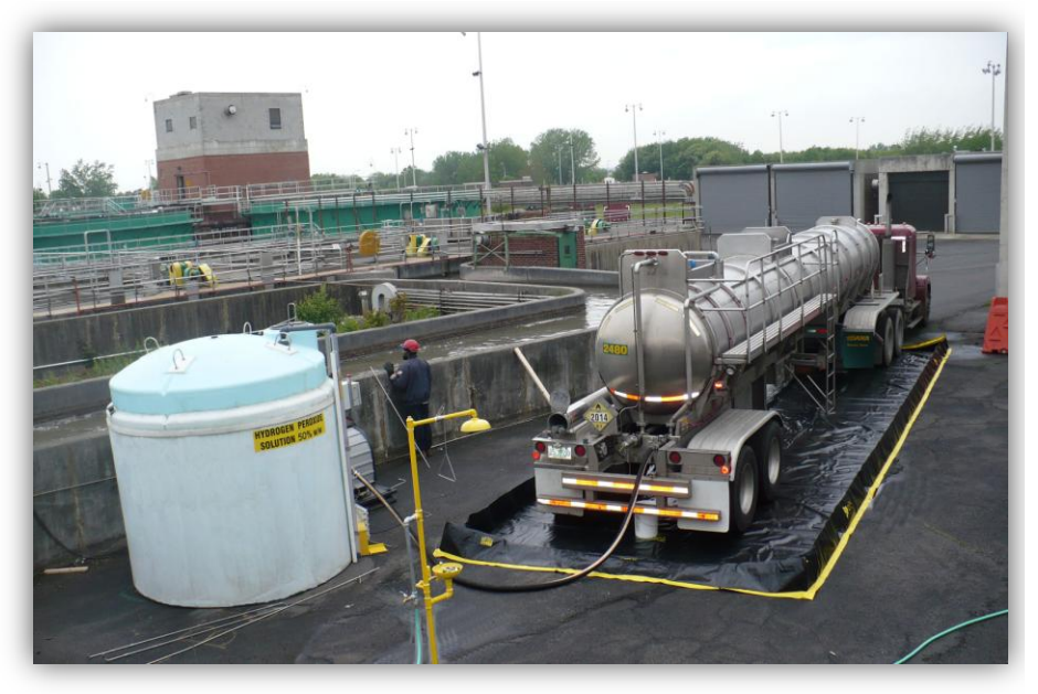
Rapid Response Hydrogen Peroxide Delivery and Set-Up

Our Applications Engineers and Equipment and Engineering Services teams will provide timely and thorough applications assistance and technical support during the entire project. From initial application assessment through equipment installation and start of chemical dosing, our highly trained and experienced personnel will make sure your application runs smoothly.